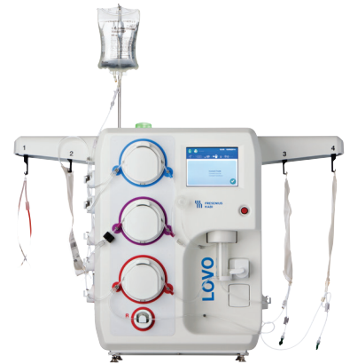
For Laboratory Use Only